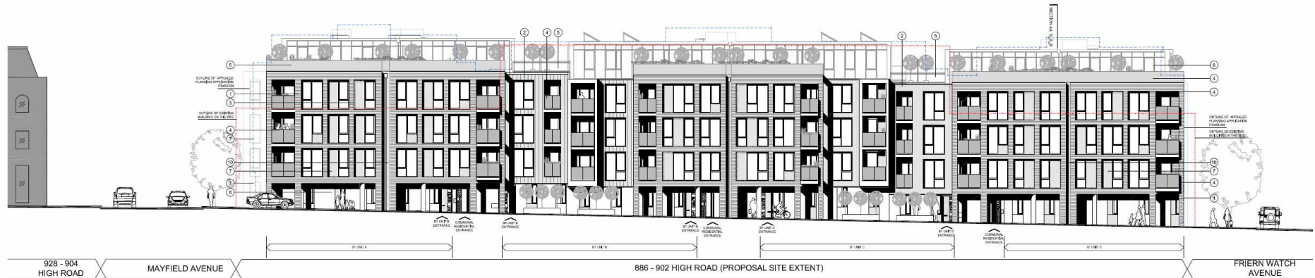
WEST (HIGH ROAD) ELEVATION